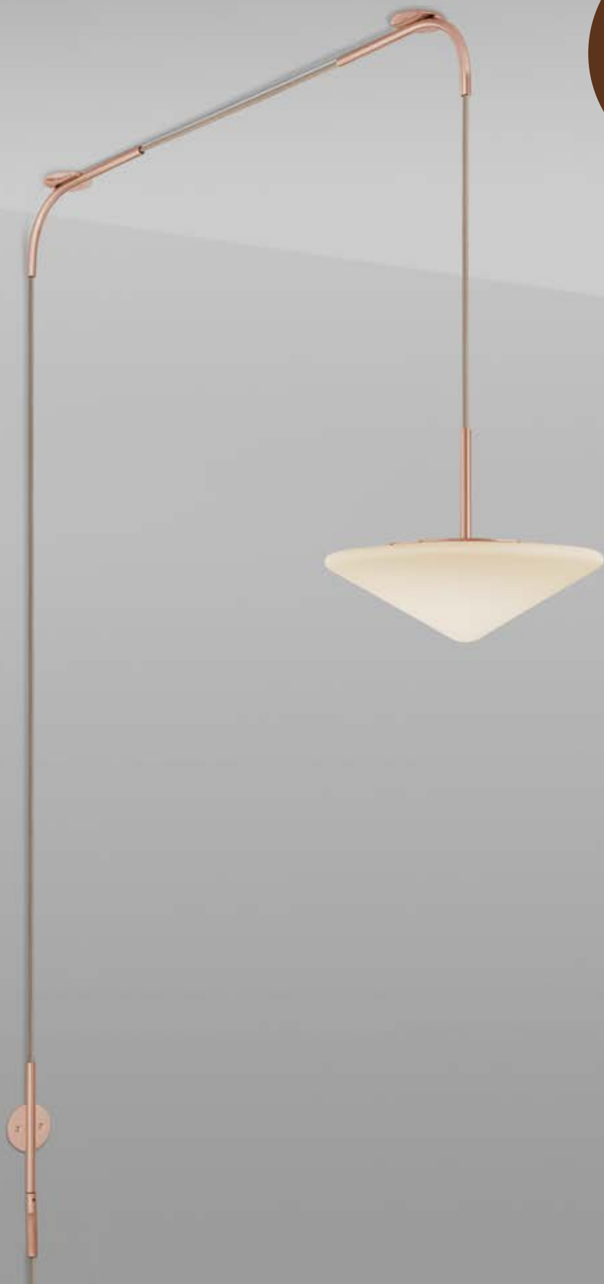
Spinne 35 Hanging Lamp