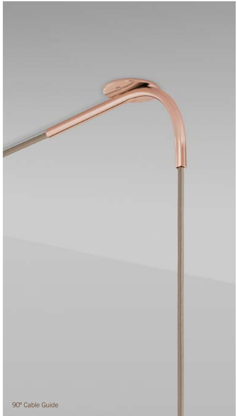
90° Cable Guide