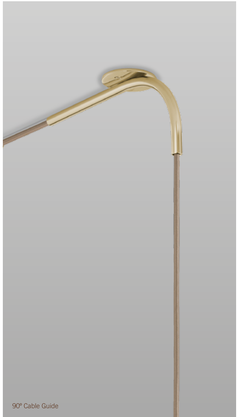
90° Cable Guide