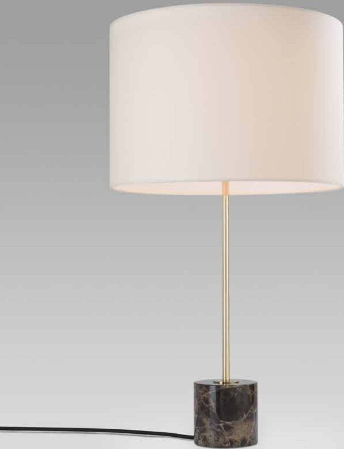
Polished Brass | Marble