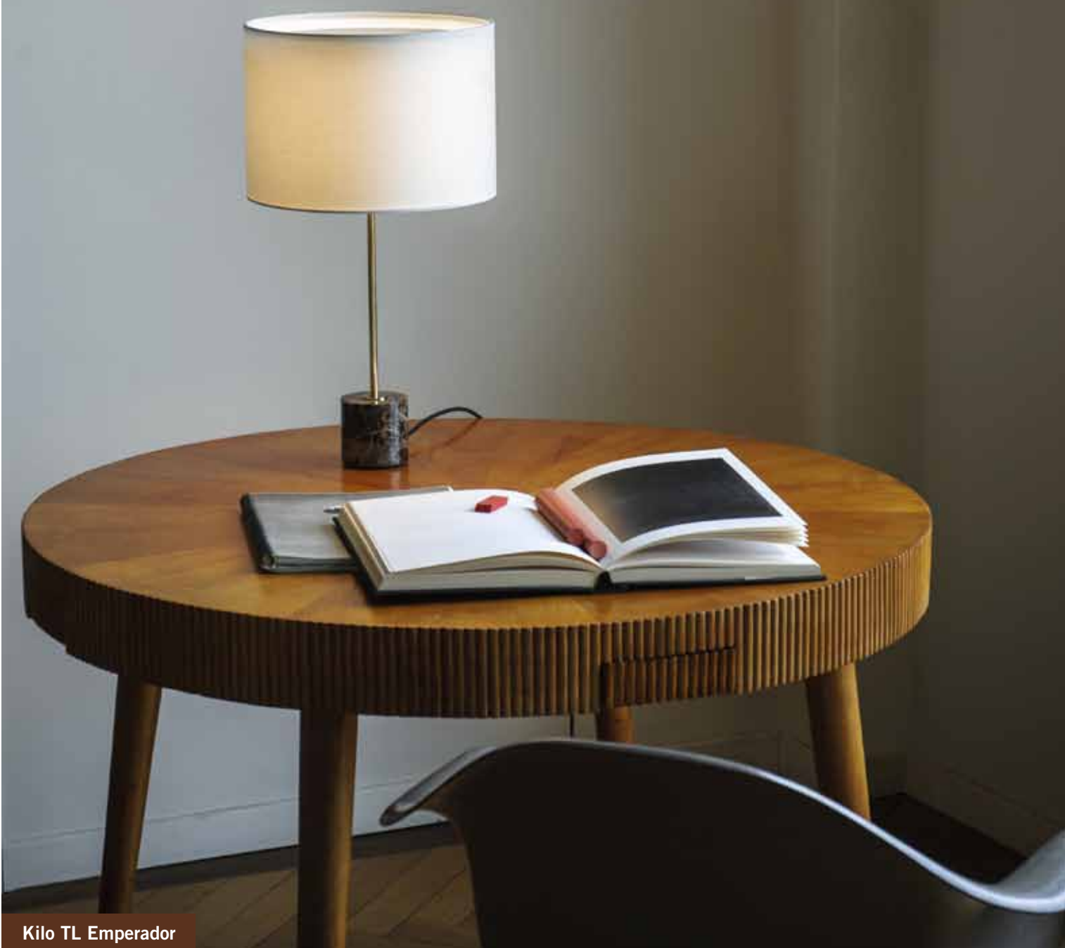
Kilo TL Emperador