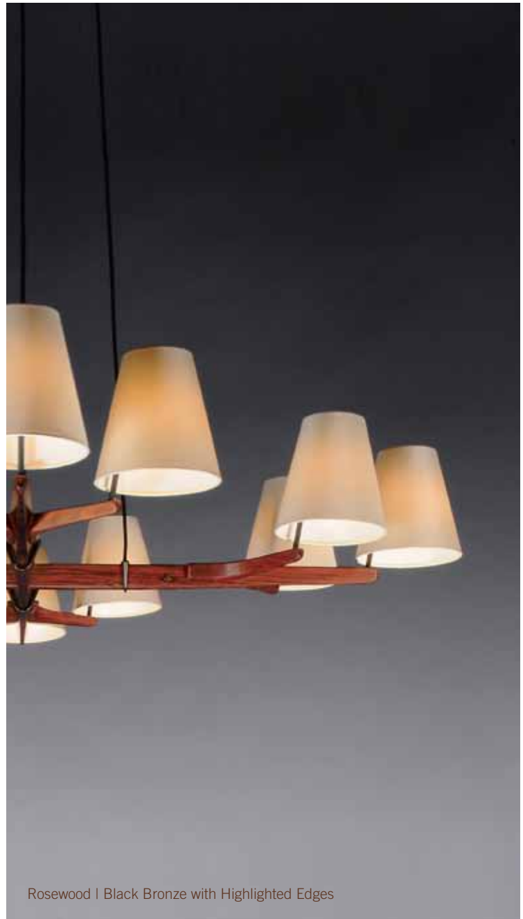
Rosewood | Black Bronze with Highlighted Edges