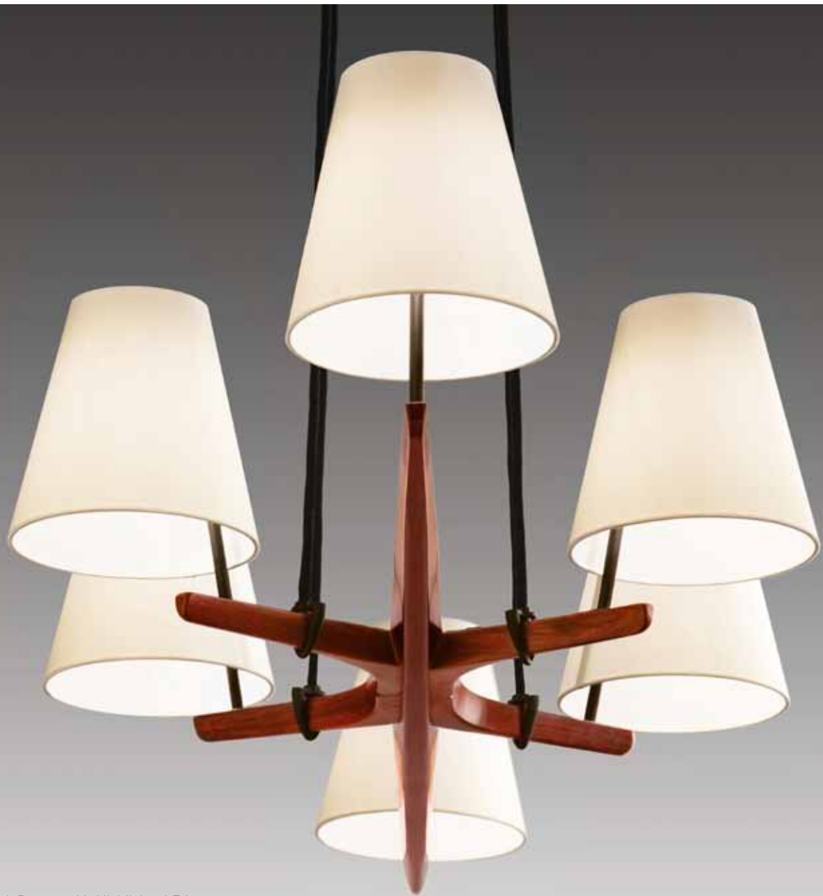
Rosewood | Black Bronze with Highlighted Edges