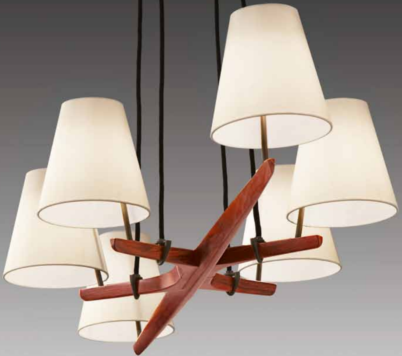
Rosewood | Black Bronze with Highlighted Edges